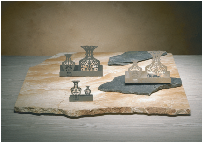
海棠福壽 | As Lucky and Long-lived as Malus spectabilis