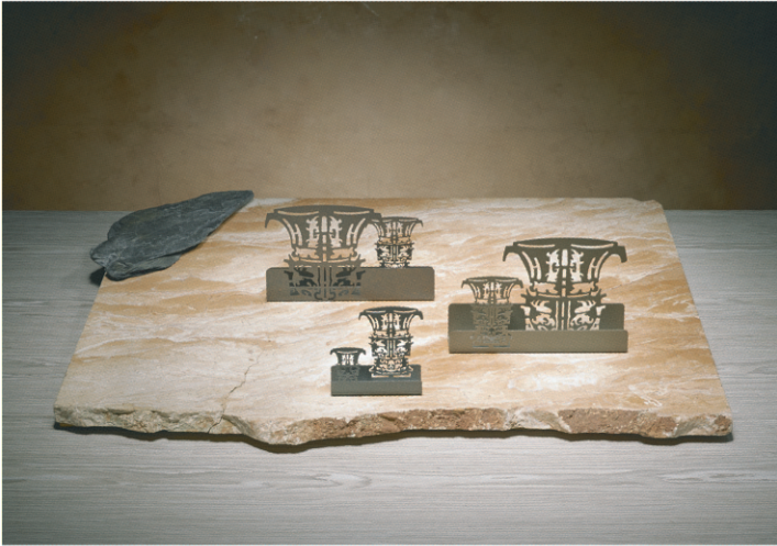
天地至尊 | Pottery Tsun