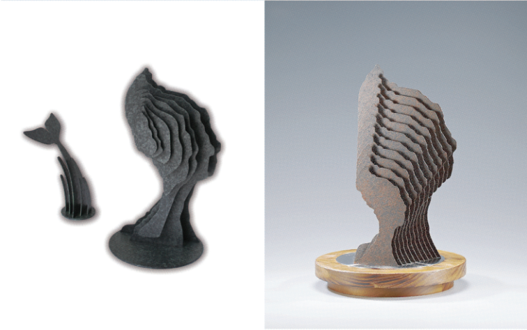
女王現身 Queen show up 30 x 30 x 41 cm