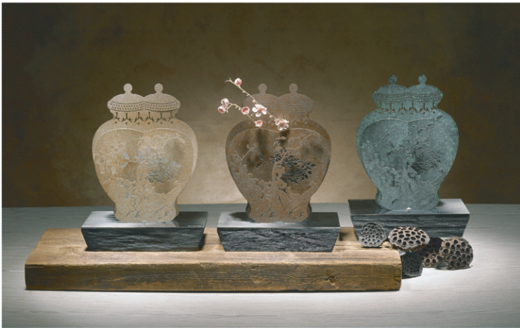
海棠福壽 As Lucky and Long-lived as Malus spectabilis 26 x 18 x 41 cm