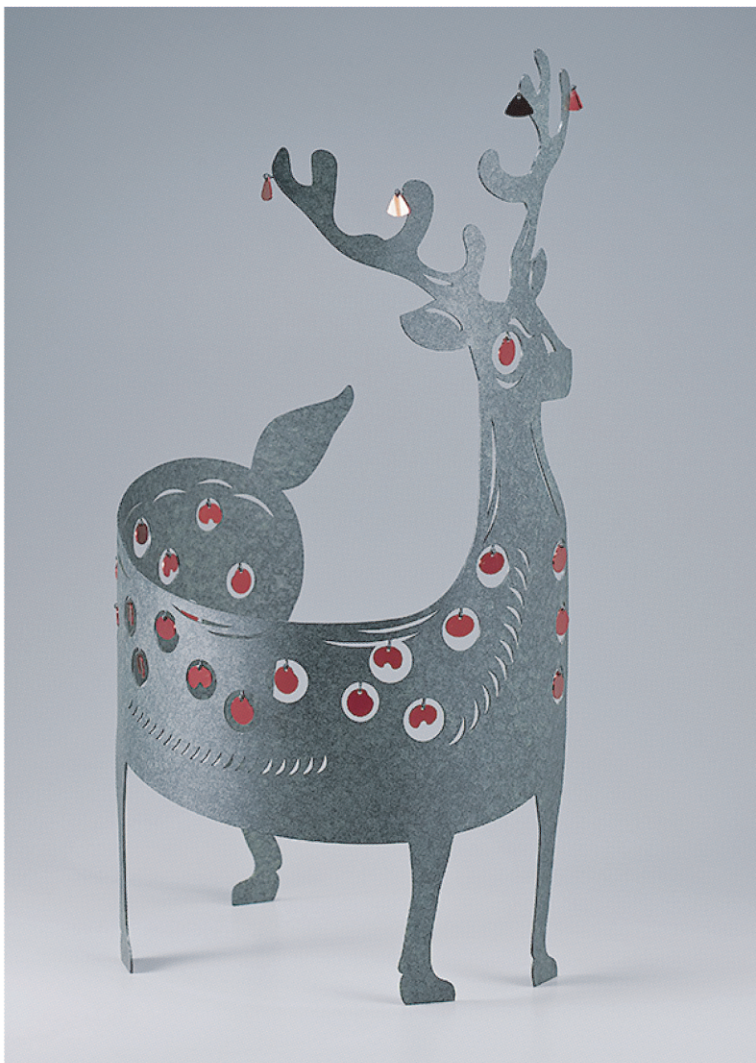
迴盪系列 | 頭角崢嶸 Round Animal | Deer